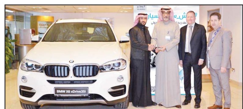
A photo from the event