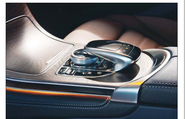
Mercedes-Benz GLC car's interior and exterior