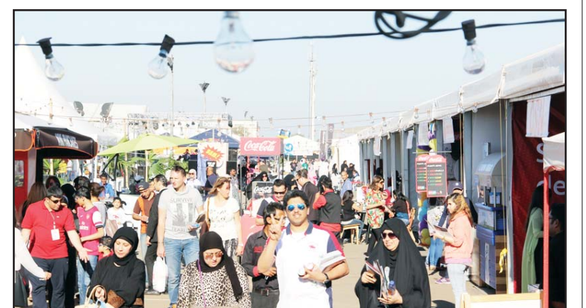
A file photo of last year's Q8 food festival

Both models come with a 4-cylinder petrol engine with direct injection and turbocharging, 4MATIC permanent all-wheel drive and a nine-stage 9G-TRONIC automatic transmission. The GLC 300 4MATIC offers 370 Nm of torque and reaches a top speed of 235 km/h