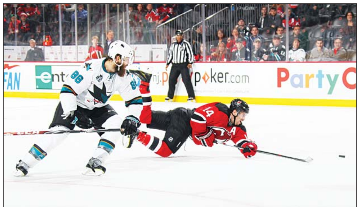
Brent Burns #88 of the San Jose Sharks takes a penalty for tripping Adam Henrique #14 of the new Jersey Devils during overtime at the Prudential Center on Oct 16, in Newark, New Jersey.

Moving the America's Cup out of home waters is just one area where Oracle continues to buck tradition.