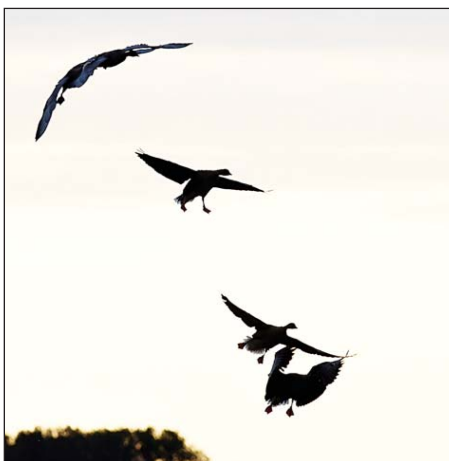
Geese come in to roost at the Martin Mere Wetlands Centre near Burscough in north west England on Oct 14. Up to 40,000 pink footed geese can be seen on the Wetlands Trust Reserve at dawn and dusk as they spend winter in Great Britain after flying from Greenland and Iceland. (AFP)

odds 'n' ends DETROIT: A new website showcasing artworks owned by the federal government chronicles the history of the United States as portrayed by artists over the past two centuries, offering an easy way to find works by favorite artists or discover pieces that may be in display nearby. The US General Services Administration, which oversees federal buildings across the nation, owns more than 26,000 paintings, sculptures, prints and other works from the 1850s to the present. Many are displayed in federal buildings and courthouses. The Detroit Institute of Arts, which has hundreds of such artworks, was hosting an event Thursday heralding the GSA's Fine Arts Collection website. The website allows users to find works by specific artists or discover pieces in a state or specific area. "No one has seen all of these works in person, but now we have the opportunity to understand the breadth of the collection," GSA's Art in Architecture and Fine Arts Director Jennifer Gibson said on the agency's website. "This site brings it all together for the first time and provides a portrait of America as seen by its artists." In addition to the GSA-owned pieces at public buildings, thousands of New Deal-era works are on long-term loan to museums, universities and nonprofits, including more than 350 at the Detroit Institute of Arts that have been used as part of special displays. (AP)