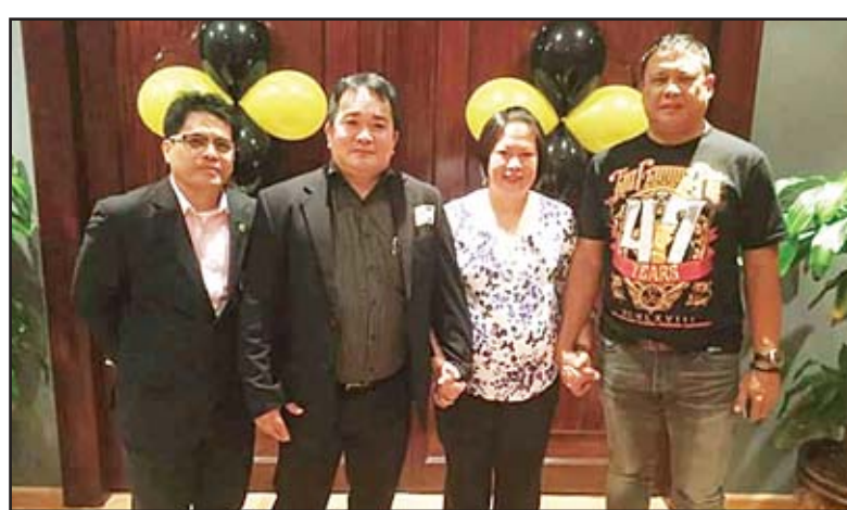
TISOK former senior officers