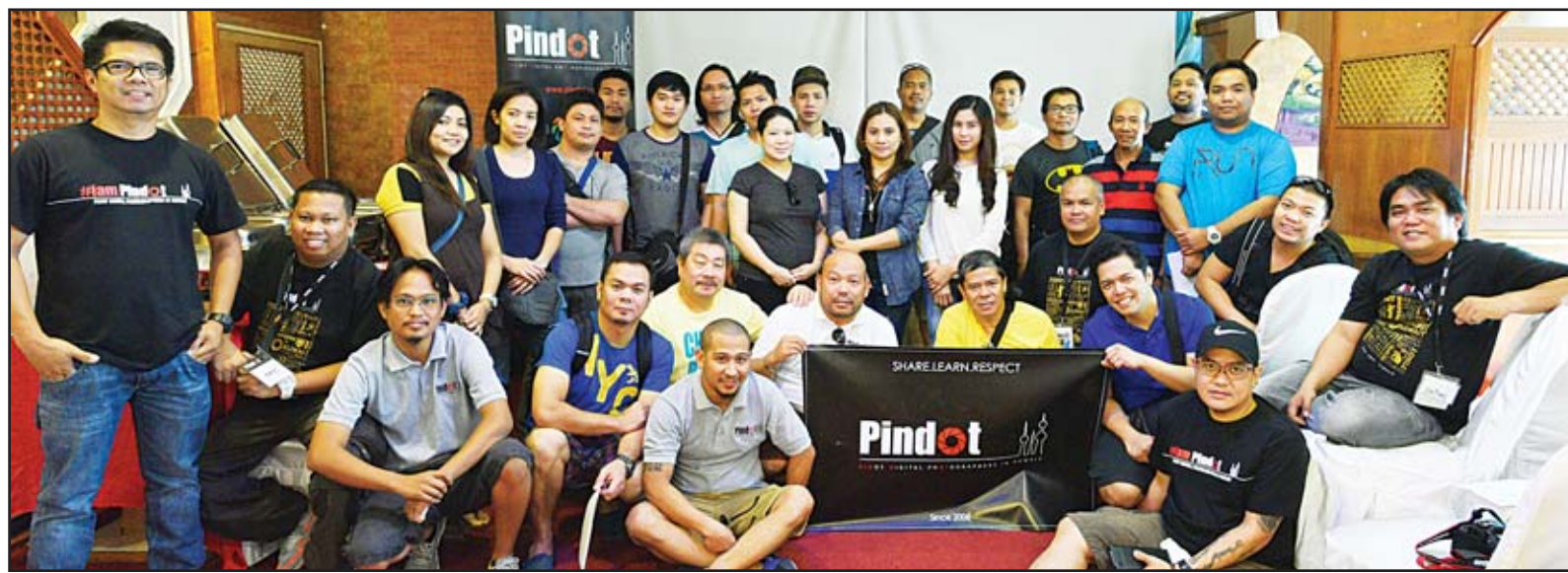
A photo from the event

means 'Click' in English founded in April 2008 is a group of Filipino workers and residents of Kuwait who share their common passion in Digital Photography. PINDOT aims to encour-