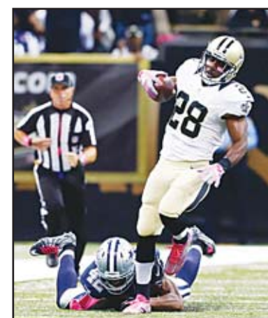
New Orleans Saints running back C.J. Spiller (28) breaks free against the Dallas Cowboys in New Orleans on Oct 4.

Joseph Randle scored the lone TD for Dallas (2-2) on a 1-yard run in the first half. The winning score enlivened a Superdome crowd stunned by Saints kicker Zach Hocker's 30-yard miss in the final seconds of regulation.