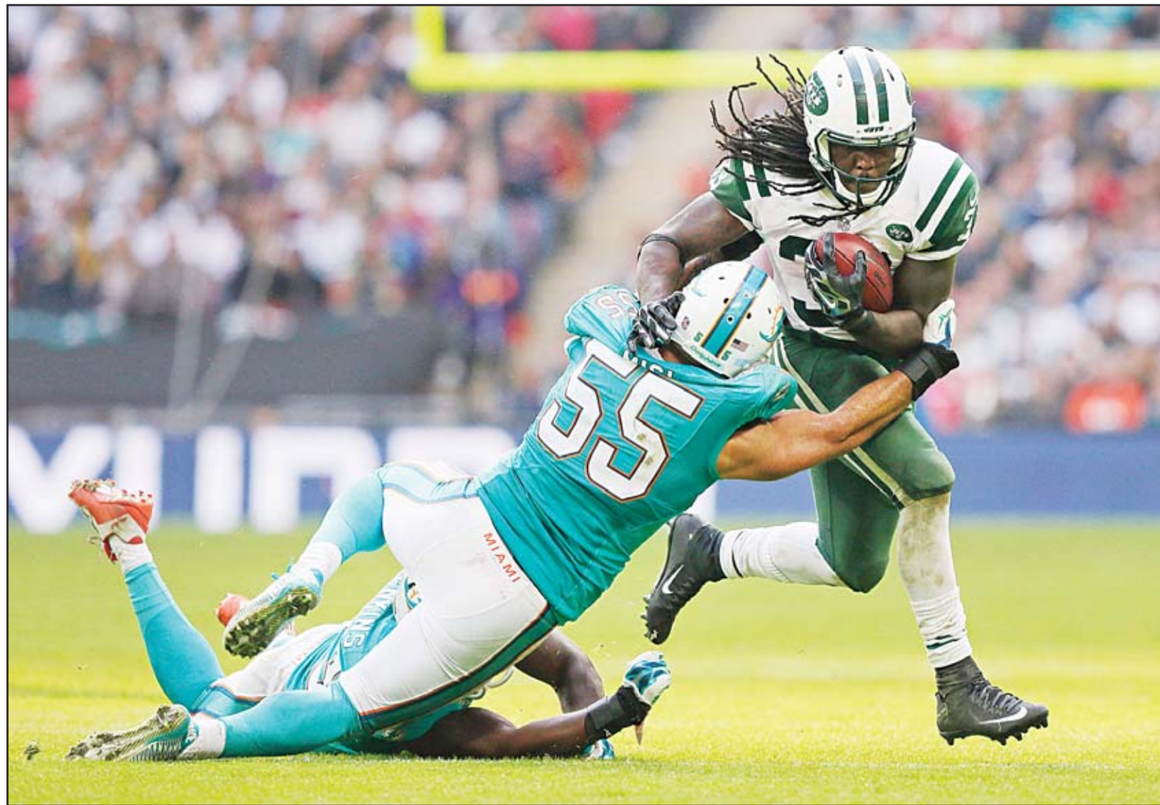
New York Jets' Chris Ivory (right), is tackled by Miami Dolphins' Koa Misi during the NFL football game between the New York Jets and the Miami Dolphins and at Wembley Stadium in London on Oct 4.

Brees, who missed New Orleans' previous game because of a bruised rotator cuff in his right (throwing) shoulder, completed 32 of 39 throws for 279 yards in his return. Mark Ingram gained 126 yards from scrimmage, and Khiry Robinson had a 1-yard touchdown run for New Orleans (1-3).