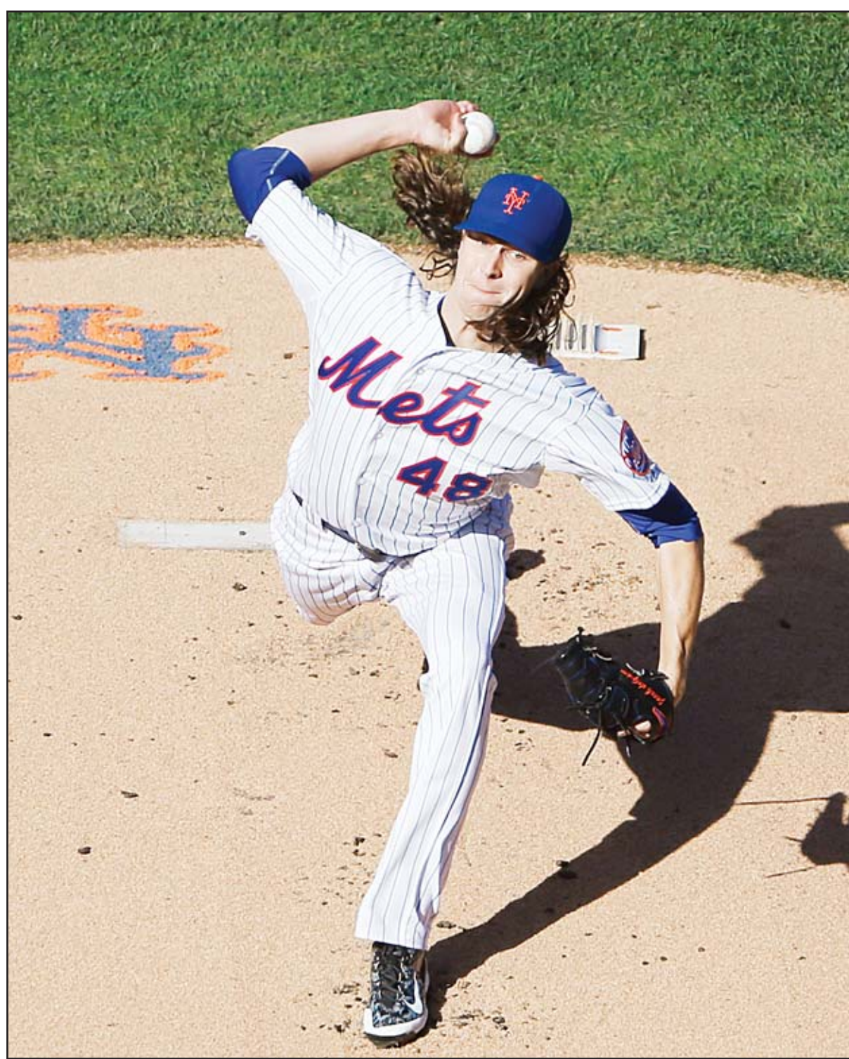
New York Mets starting pitcher Jacob deGrom delivers in the first inning of a baseball game against the Washington Nationals in New York on Oct 4.

In St Petersburg, Fla., Mark Buehrle failed to become the fifth major leaguer