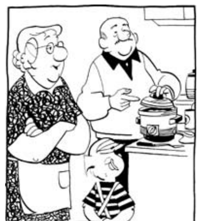
"THAT'S MY NEW CROCKPOT... RIGHT NEXT TO MY OLD CROCKPOT."