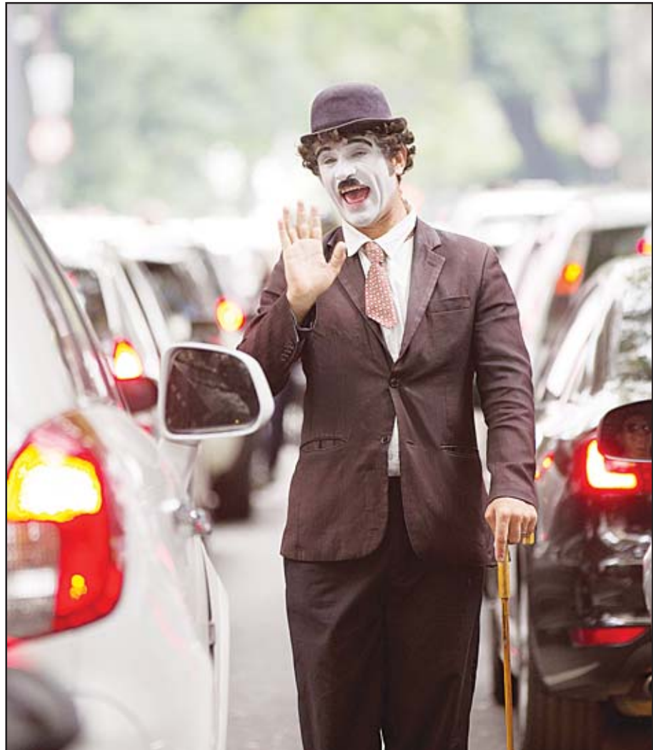
A street artist dressed as Charlie Chaplin performs in Sao Paulo, Brazil on Dec 1. Sao Paulo is the most populous city in Brazil, South America and the Southern Hemisphere.